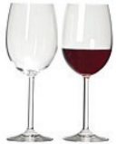
36 x Red wine glasses