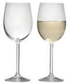
36 x White wine glasses