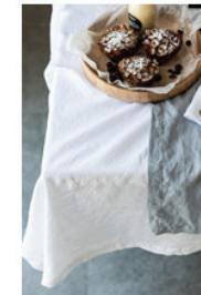
4 x White table cloth (178 x 274 cm)