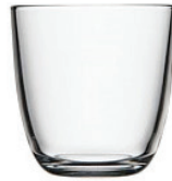
36 x Water glasses