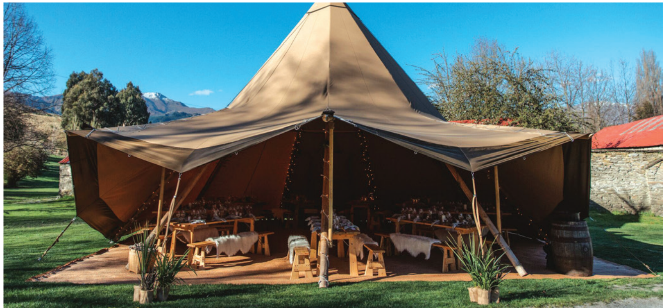
Roy Schott Photography