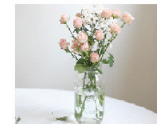
30 x Flower jars small