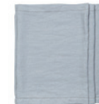
2 x Grey table runner (41 x 272 cm)